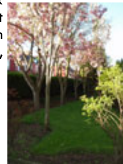
Space for reflection